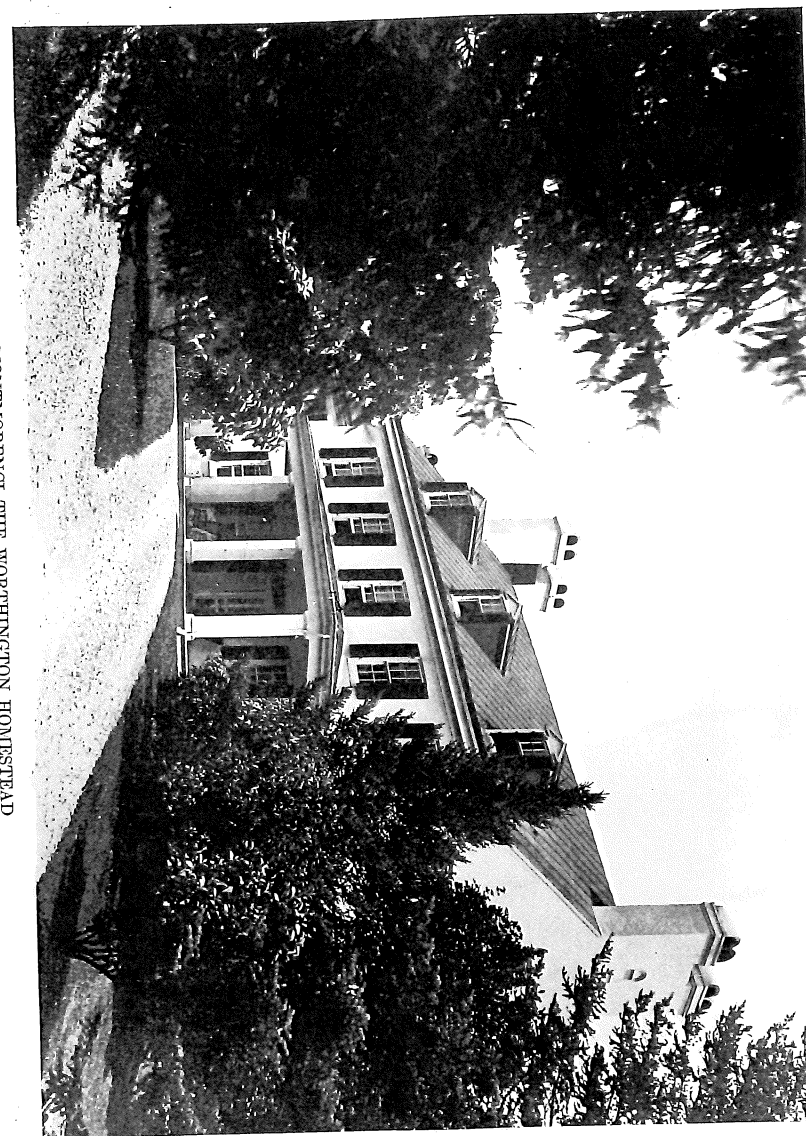
MONTMORENCI, THE WORTHINGTON HOMESTEAD