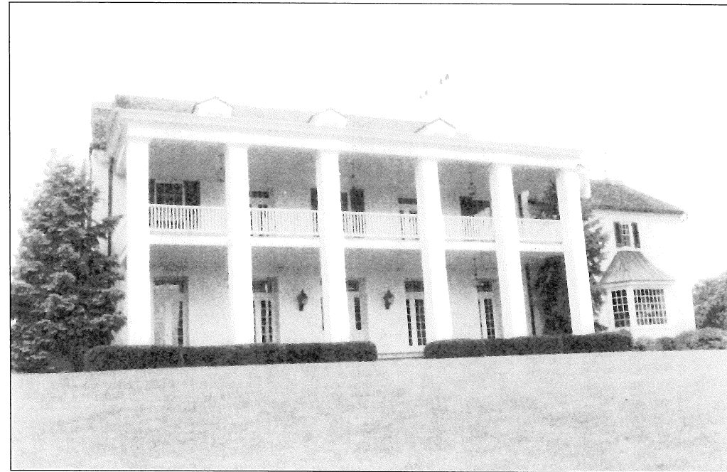
This beautiful house, with its distinctive two-story porch, is known as Montmorenci. Beautifully situated on a hill overlooking the Worthington Valley, the Worthingtons built Montmorenci in 1742. One of the notable architectural features of the house is its dramatic "hanging" stairway in the center hall.