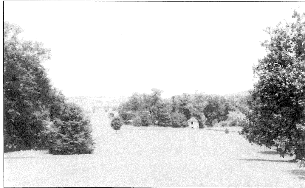
This breathtaking view of the Worthington Valley illuminates why so many of Maryland's most prominent families built their homes in this scenic area. The area is largely unchanged today, though increasing numbers of houses threaten views such as this one.