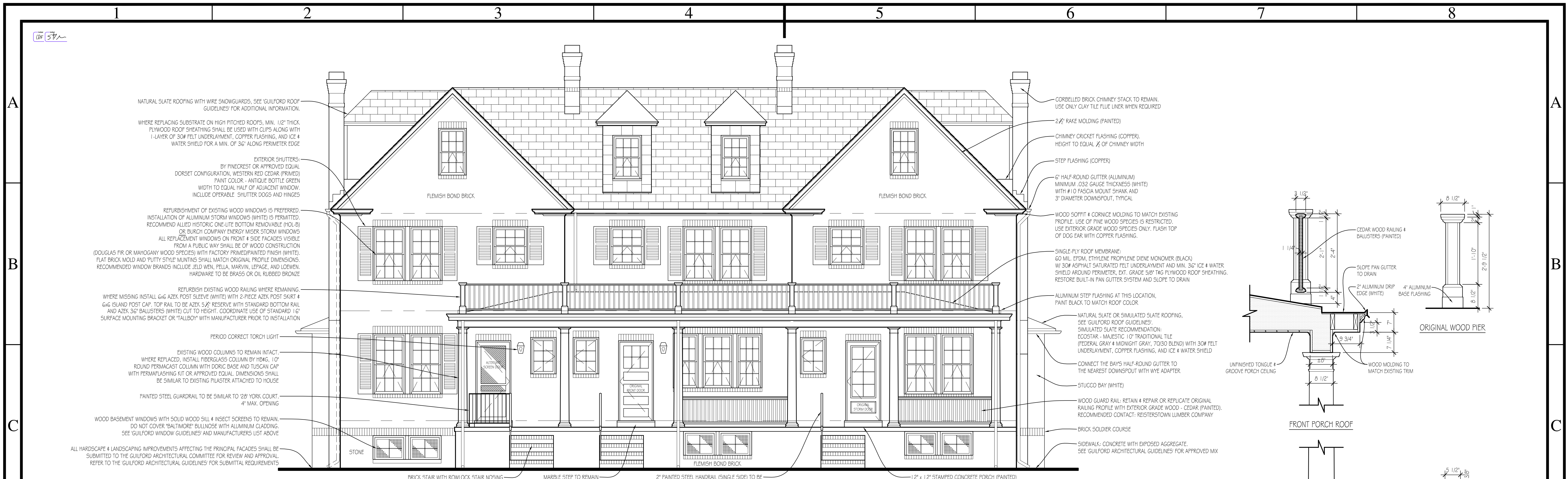
1 FRONT ELEVATION - YORK COURT ELEV. SCALE: 1/4" = 1'-0"